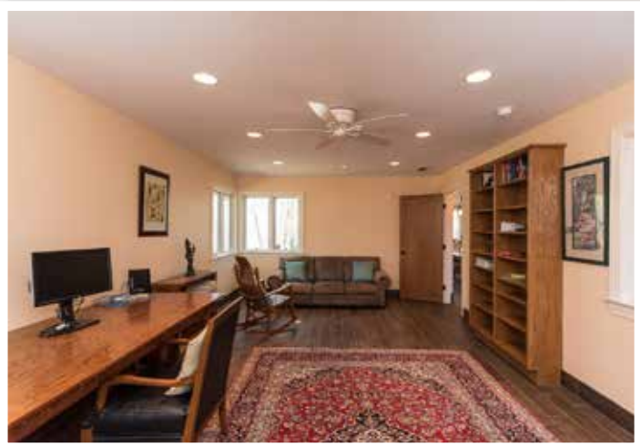
Family Room / Office