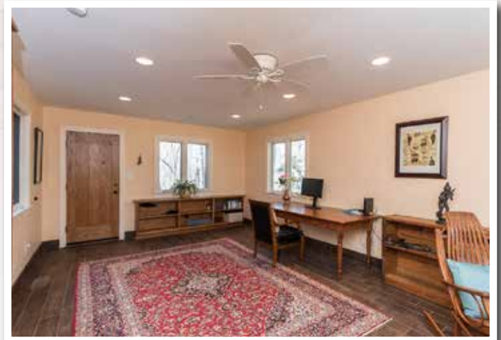
Family Room / Office