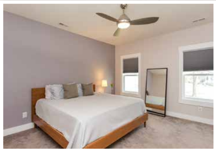
Second Floor Master Bedroom