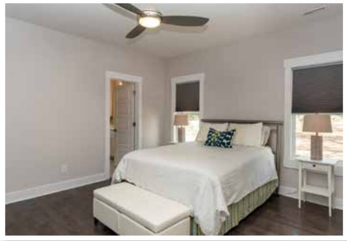
Main Floor Master Bedroom