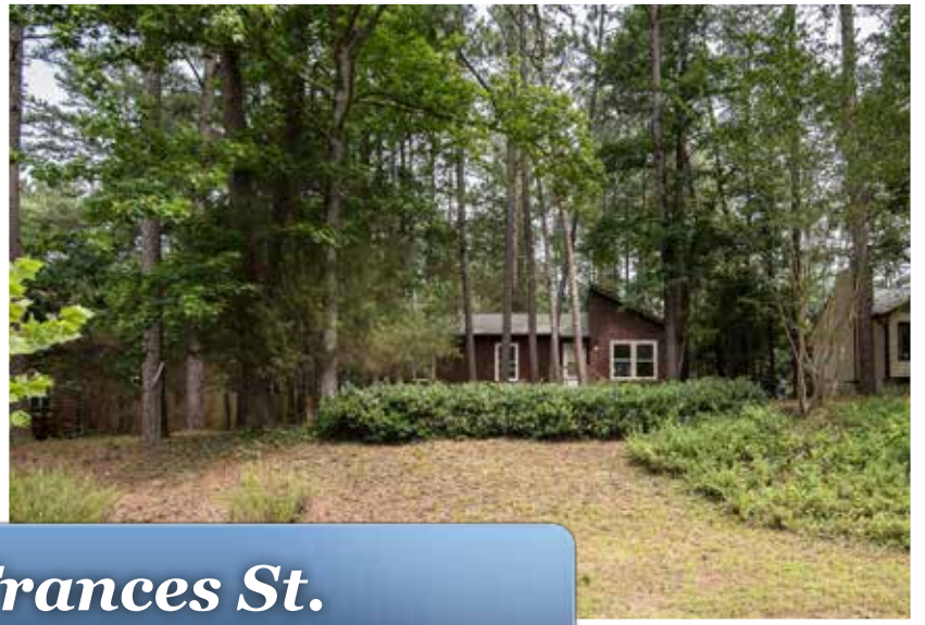
16 Frances St. Chapel Hill, NC 27517