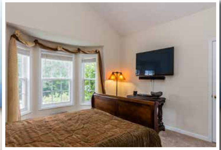
Main Floor Bedroom