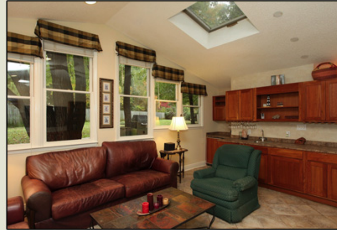
Family Room and wet bar