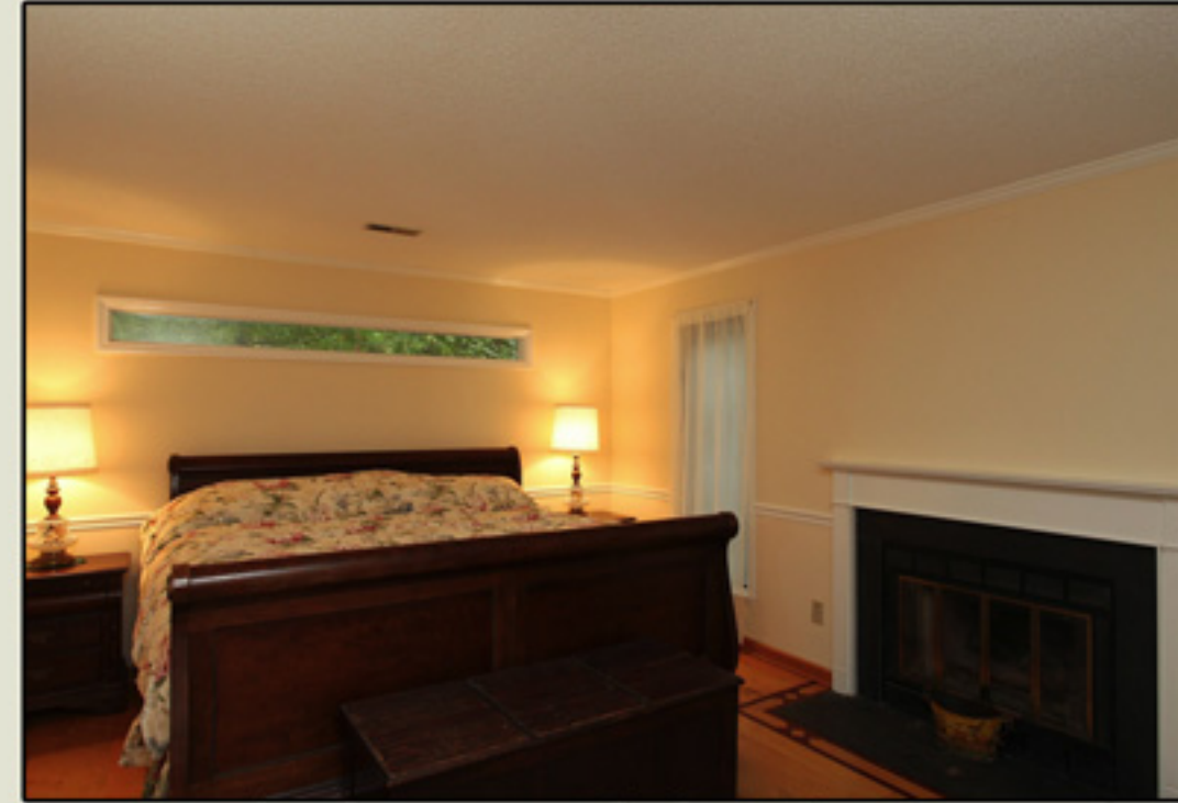
Master bedroom with fireplace