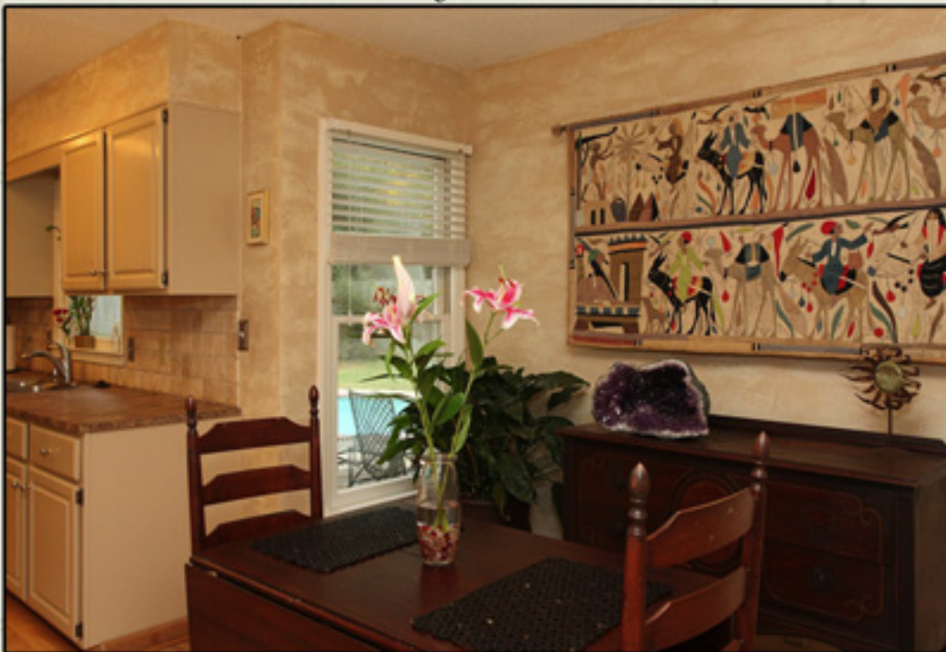
Kitchen and Breakfast Nook